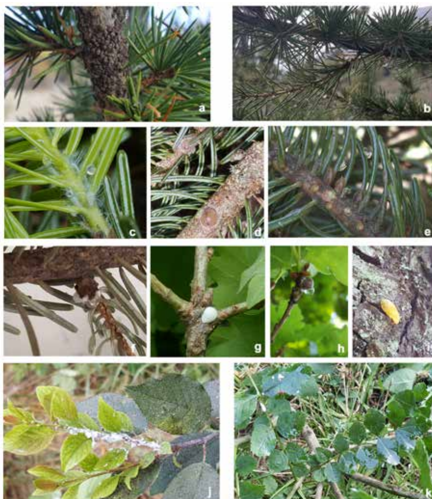
Figure 2. Cinara cedri (a) and its honeydew's drop (b), Schizolachnus pineti (Fabricius) (c), Eulecanium sericeum (d), Nemolecanium abietis (e), Physokermes hellenica (f), Acanthococcus roboris (g), Kermes sp. nr vermillio (h), Marchalina caucasica (i) and nymphs of Metcalfa pruniosa and its honeydew on the leaves (k)

S. pineti is determined on young shoot of fir with honeydew drops (Figure 2c). It is found in Bolu/Aladağ, 40°38'43"N 31°37'36"E, Abies bornmuelleriana , 1360 m, 16.vi.2016; Bolu/Gölcük National Park, 40°36'59"N 31°35'13"E, A. bornmuelleriana , 1230 m, 16.vi.2016; Bolu/Kuzgöl-