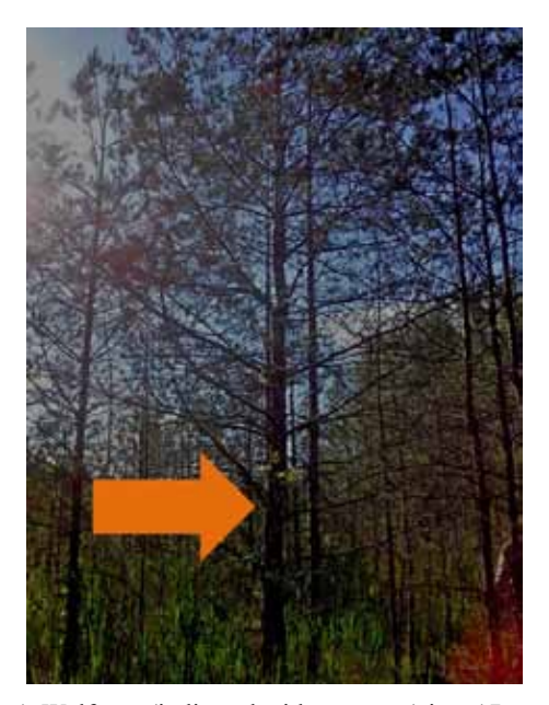
Figure 1 . Wolf tree (indicated with an arrow) in a 17-year old self-regenerated Scots pine stand in Lithuania

eters, and utilize a larger growing space, thus reducing stand timber volume.